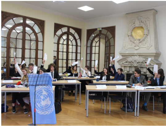
A UNESCO school, the Lycée International participates in humanitarian missions to Togo and Cambodia.

We run a service-learning trip to India, overnight trips to Amsterdam and the D-Day beaches, and an Upper School theater trip to London. We also send an annual delegation to the MUN conference in The Hague.